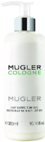
BODY LOTION CREMA CORPO