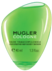
HAIR & BODY SHOWER GEL PER CORPO E CAPELLI

BOTTLES 1.35 & 2.7 fl.oz. FLACONI 40 & 80 ml