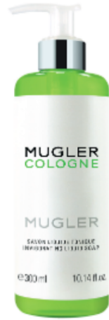
LIQUID SOAP SAPONE LIQUIDO