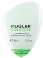
BODY LOTION CREMA CORPO