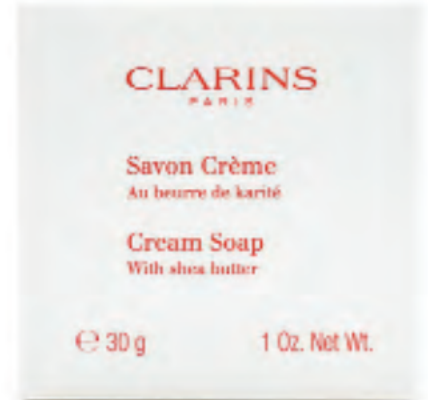
CREAM SOAP IN A CARDBOARD BOX 30 & 60 g