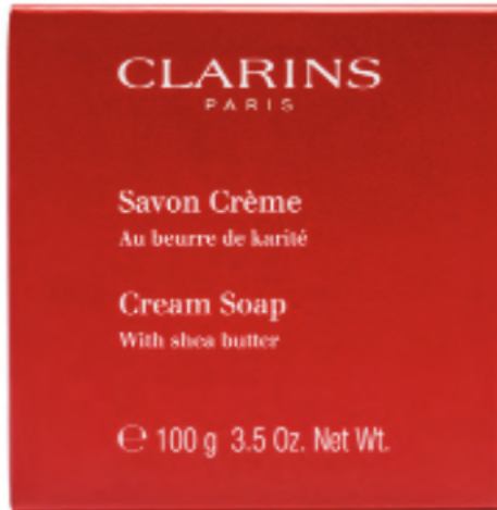
FILM WRAPPED CREAM SOAP IN A CARDBOARD BOX 100 g