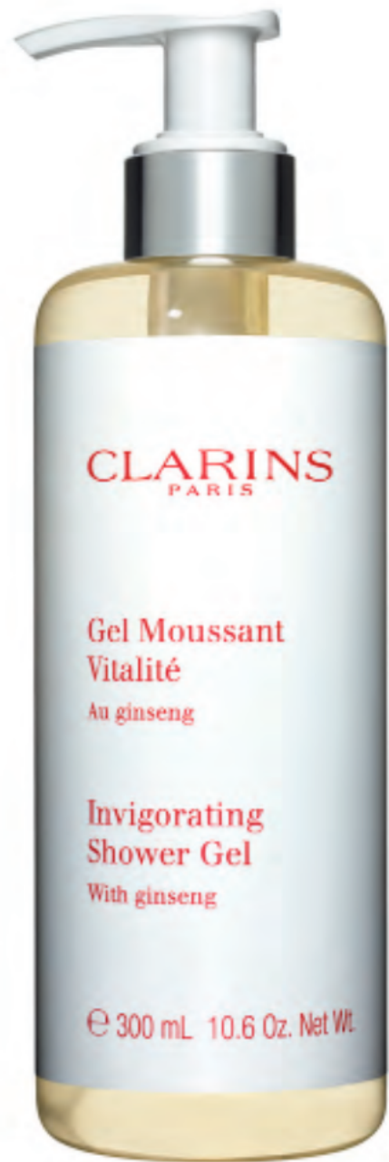
ECOPUMP 300 mL