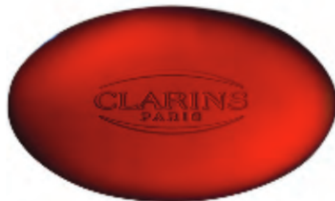
FILM WRAPPED GLYCERIN SOAP 45 g